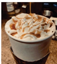
Cabin Fever Coffee* 312 Clinton Street