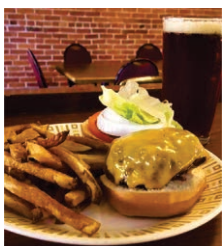
Miami & Erie Lounge* 406 Clinton Street