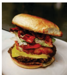
Spanky's* 120 Clinton Street