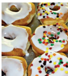
Meek's Pastry Shop* 315 Clinton Street