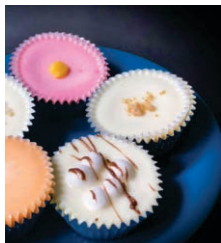
A little slice of heaven* 518 Clinton Street