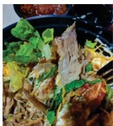
Dos Eppis* 200 Clinton Street