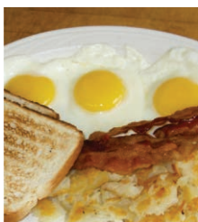
Kissner's Restaurant* 524 Clinton Street