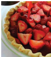
Bud's Restaurant* 505 W. 2nd Street